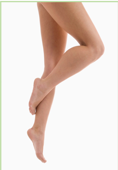
Enjoy lovely legs for summer

With bare-leg season around the corner, spring is an excellent time to begin treating your veins. If you have any vein concerns, call us to book an appointment for a full venous assessment that includes ultrasound by a qualified phlebologist.